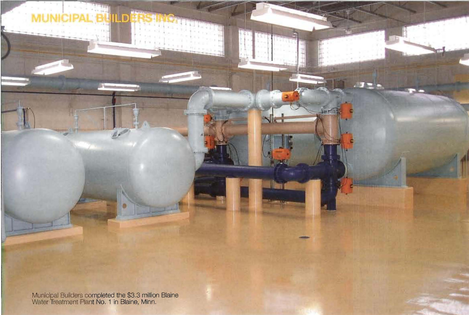
Municipal Builders completed the $3.3 million Blaine Water Treatment Plant No. 1 in Blaine, Minn.